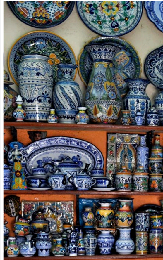
Talavera Shop, Puebla

Spend the morning at awe-inspiring Monte Albán, the ancient Zapotec capital. This archaeological site features a ceremonial plaza as well as a ball court, observatory, various tombs, and several temples. Continue to San Antonio Arrazola, home of the internationally famous Oaxacan