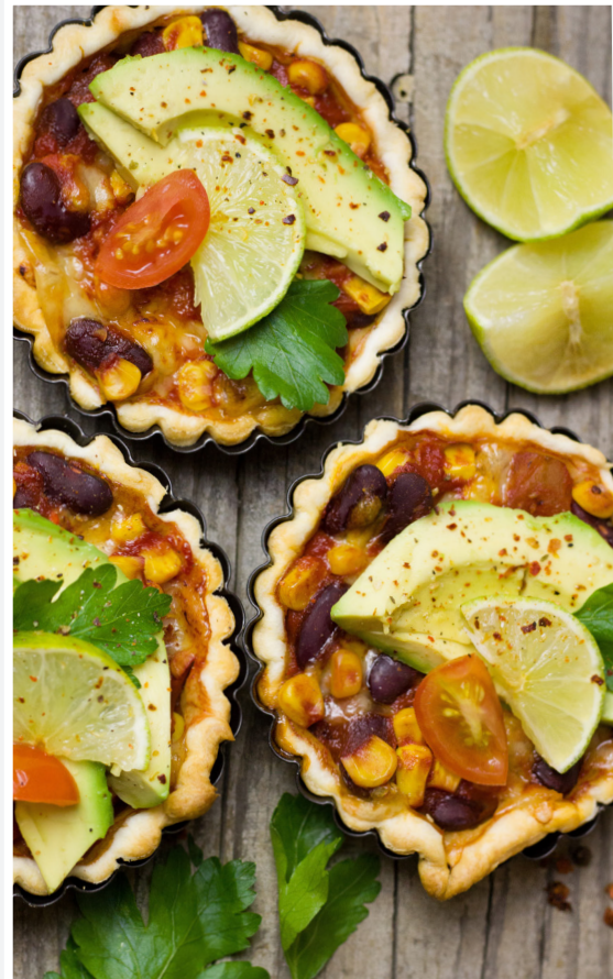
Mexican Flavors