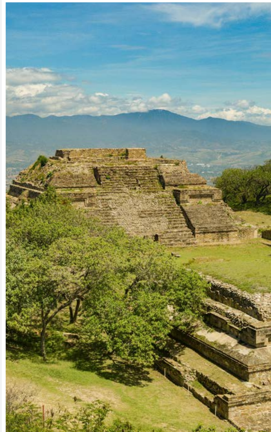
Monte Albán