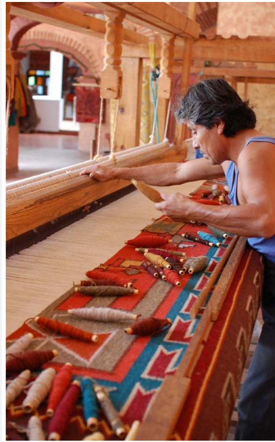
Weaver in Oaxaca