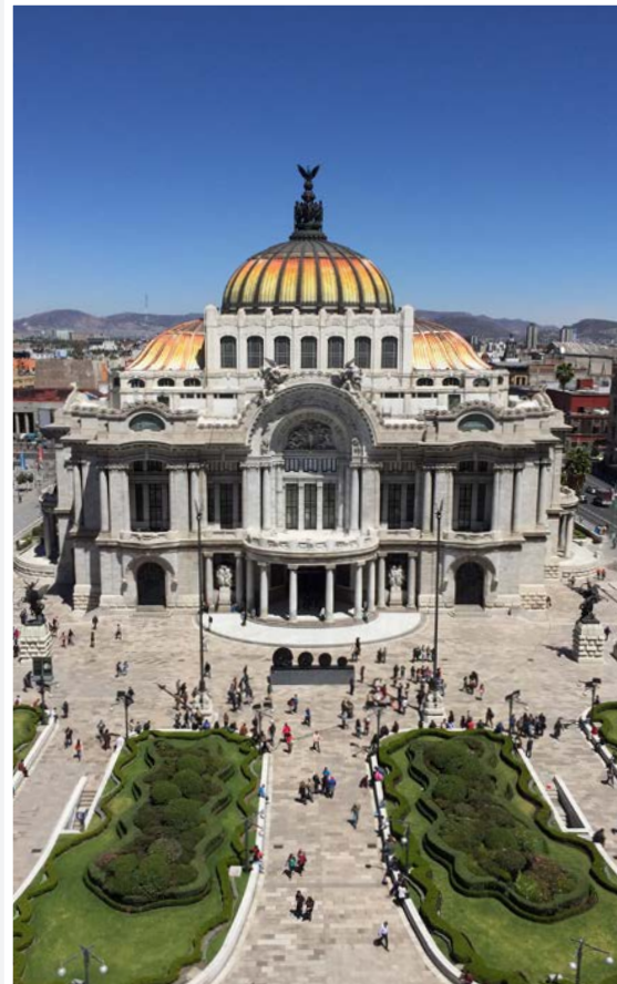
Palace of Fine Arts, Mexico City