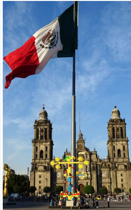
Zócalo with Mexico City Metropolitan Cathedral in background

Hotel Zócalo Central (Included meals: Breakfast, Lunch)